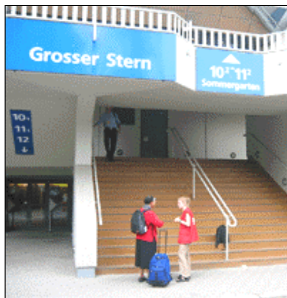
Entrance Grosser Stern (GS)

The electronic message centre is sponsored by the Federal Ministry of Education and Research.