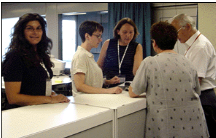
The Voting Office in Action