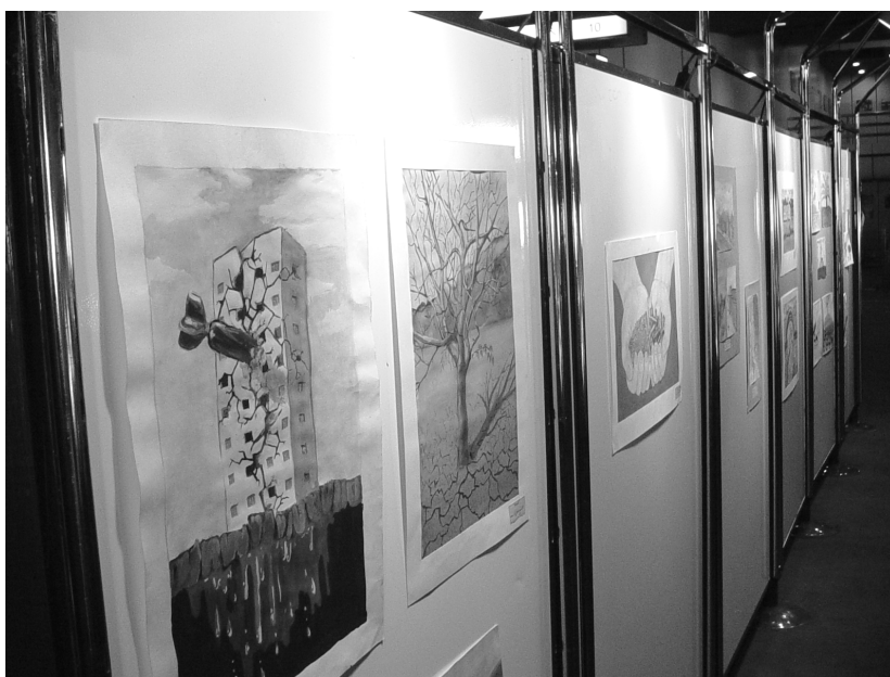
An exhibition of children painting's in hall 1

The scholarly and the political contributions of Jacob and Wilhelm Grimm were not limited to Germanic languages, literatures and folk traditions. In contrast, they maintained professional and personal relationship to many important scholars, writers and artists of their time – particularly because they knew the history of their own people as thoroughly as they did their understanding of other cultures and traditions was sophisticated and open minded.