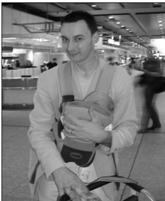
Our youngest participant - 2 months!