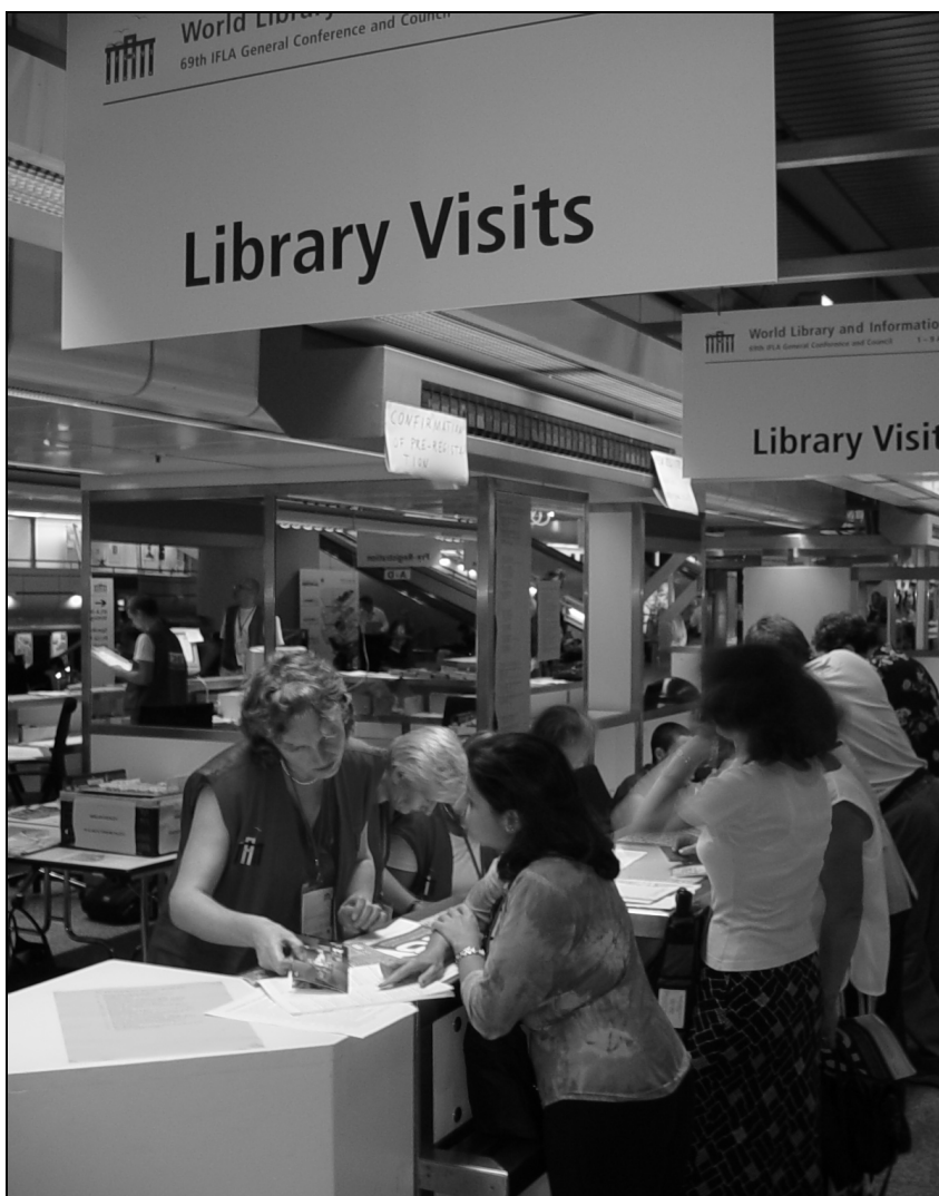
The registration booth :your gate to Berlin libraries

There are also additional brochures available for individual visits or for visits of small groups to several other libraries upon request. Please ask about these and the directions at the counter for Library Visits in the registration area.