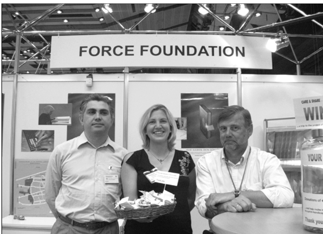
Impression of the Exhibition

Otherwise you may miss people trying to contact you or important announcements!