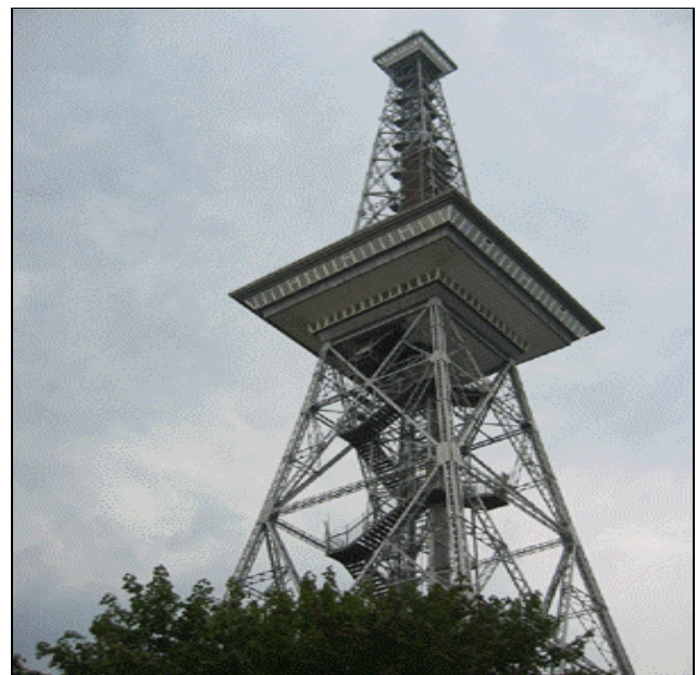
This is not the Tour Eiffel!

The Ministère de la culture et de la communication, Direction du livre et de la lecture and the Bibliothèque publique d'information (BPI) are represented at booth H38/H40 together with the bibliothèques municipales and bibliothèques départementales de prêt, while the Bibliothèque nationale de France (BnF) is to be found at booth H32/H33.