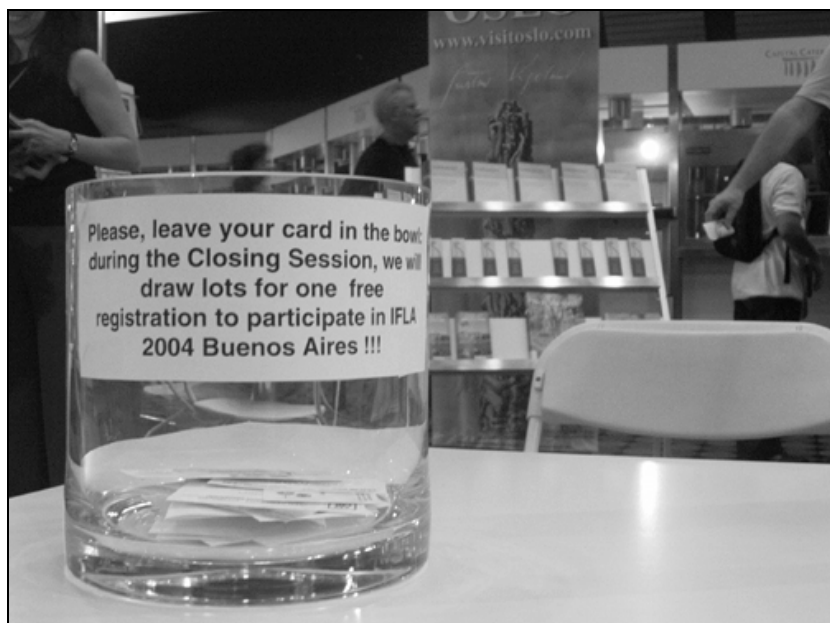
Buenos Aires Bowl

For more details, please visit the booth of the Bundesvereinigung Deutscher Bibliotheksverbände, BDB (Federal Union of German Library Associations), Area C, booth C 10