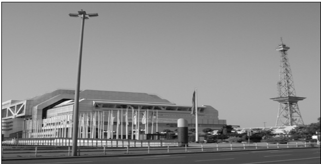
August 2003