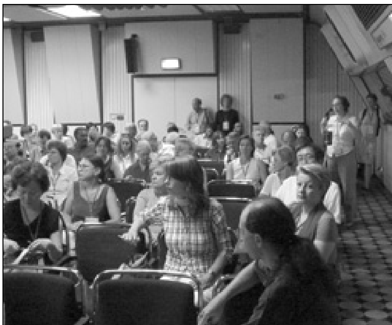
Meeting Knowledge Management