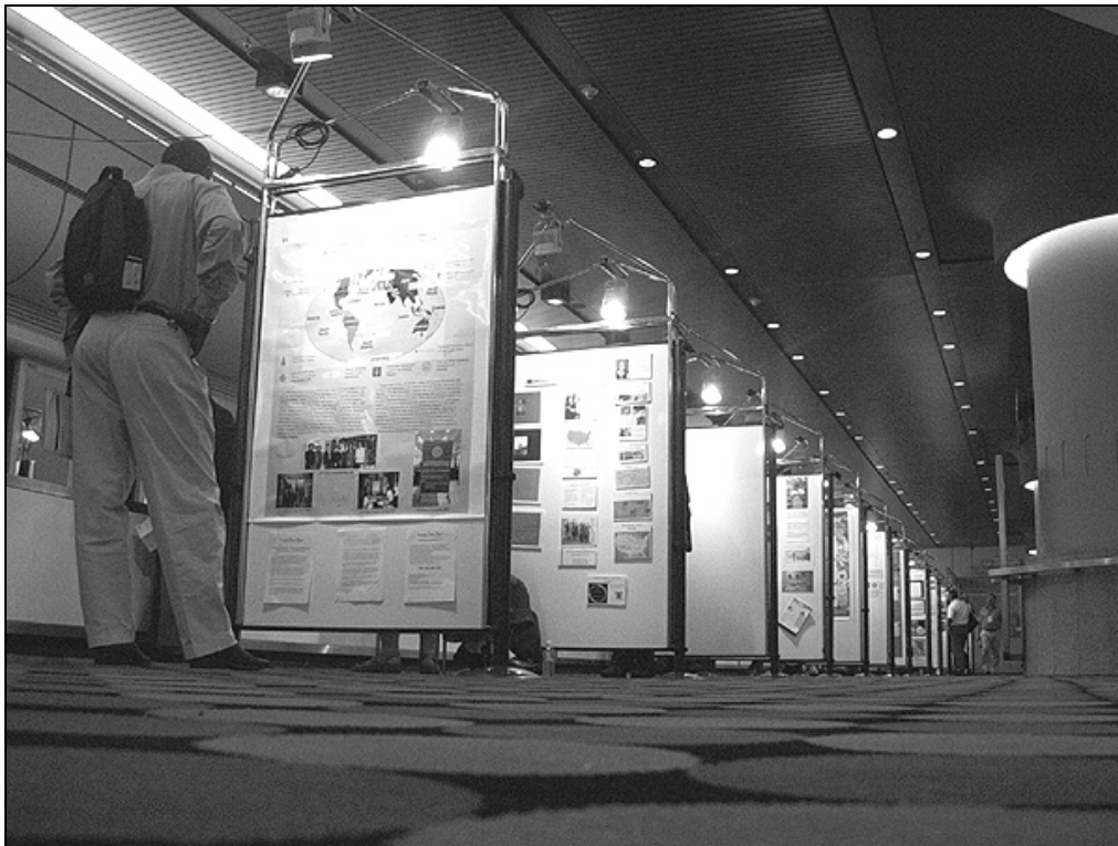
Visit the Poster sessions at the red side of ICC!