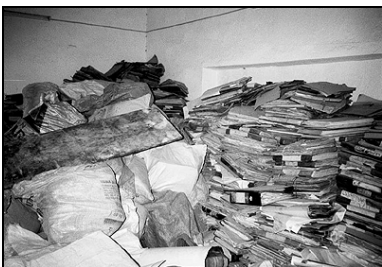
Bags filled with archival documents in a mosque*