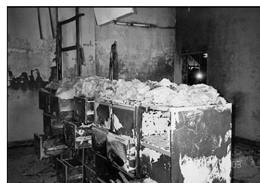
National Library, part of the stores*