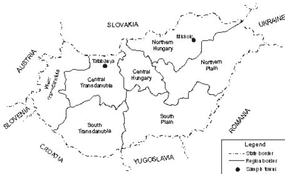
Location of the sample areas in Hungary