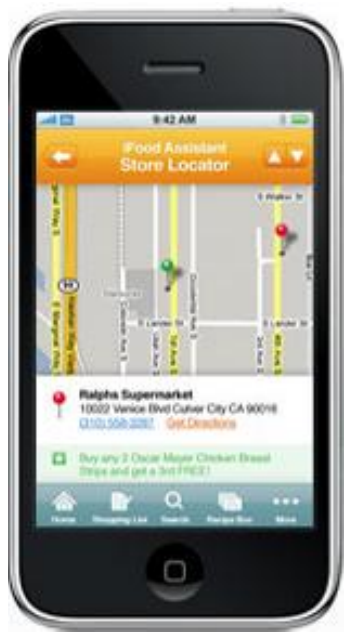
Figure 1: Store locator from the "iFood Assistant"

"Foodle<sup>4</sup>" has an integrated dictionary with a lot of product items. Based on this dictionary words are completed automatically so that typing one or two letters is often all what is necessary to add a new item to the list. "Foodle" is location-aware so that when an item is checked off from a list, the application remembers the GPS location for future reference. When a user returns to that location, a cross-hair is shown in that item's checkbox to indicate the item is nearby. The list can be sorted in such a way that the nearby items are shown on top of the list while the checked ones dive to the bottom of the list.